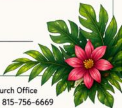
Photo Notice: Photos and/or video may be taken throughout the event to capture activities and share the VBS experience through church communications. If you prefer your child not be included, please notify a leader at check-in.

FORMS ARE AVAILABLE ONLINE OR IN THE CHURCH OFFICE.